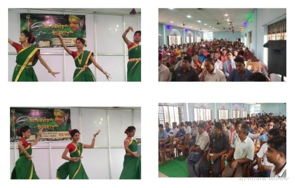
Non-AC Hall of accommodation 300 participants equipped with hanging projector for cultural activities

AC Hall of accommodation 100 participants equipped with sound system and projector for cultural activities